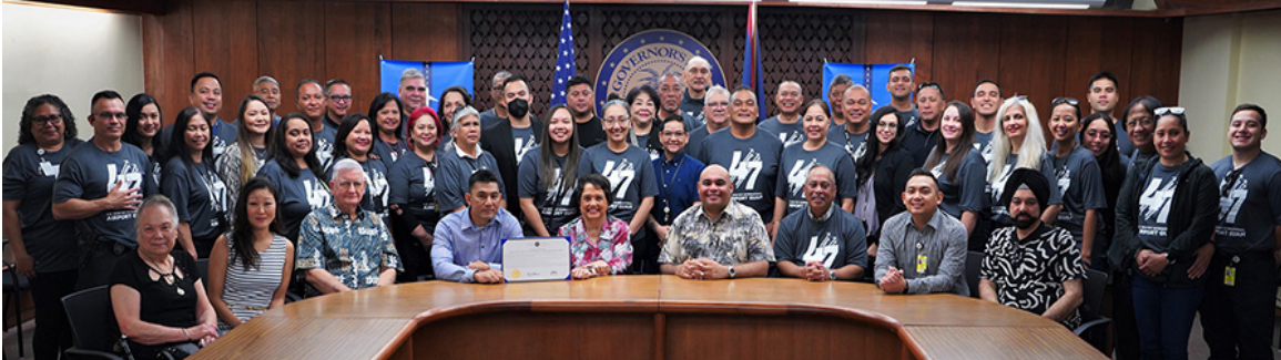
Celebrating Forty-Seven Years