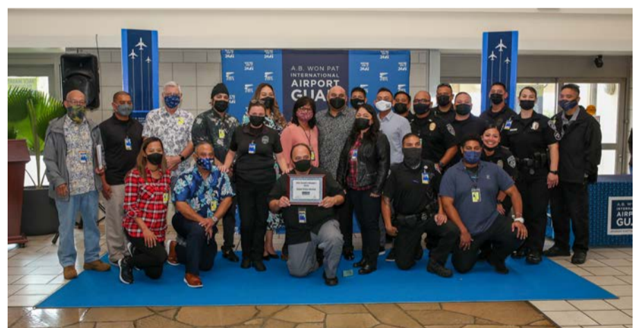
EXECUTIVE MANAGER'S AWARD Airport Police Division