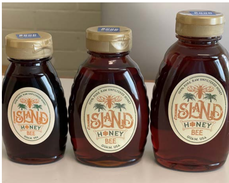
Award Winning Wild Flower Honey from PCR's "backyard" (8, 12, or 16 oz sizes - L to R).