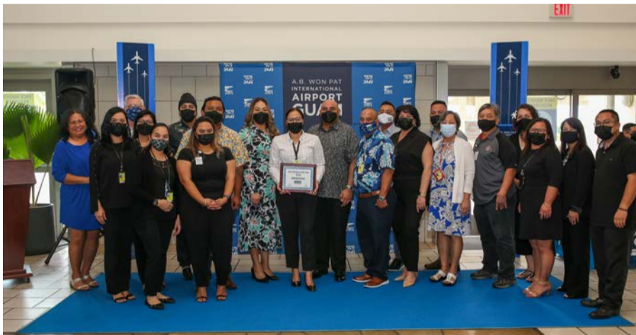
DIVISION OF THE YEAR Administration Division