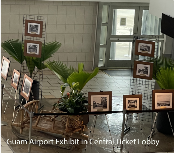
Guam Airport Exhibit in Central Ticket Lobby

Guam's official flag is proudly flown to represent Guam and the CHamoru people and heritage. The flag of Guam dates back to 1917 and was officially adopted on February 9, 1948. The oval outline of the Guam Seal represents the ancient CHamoru slingstone, a weapon skillfully wielded by our ancestors. In the seal are the Hagåtña River where it meets the sea; the beach graced by a lone coconut palm that symbolizes sustenance; and a flying proa, the chief means of transportation for early CHamoros. These aspects of CHamoru culture symbolize the courage, perseverance and prowess of our ancestors. (Extracted from Guampedia.com)