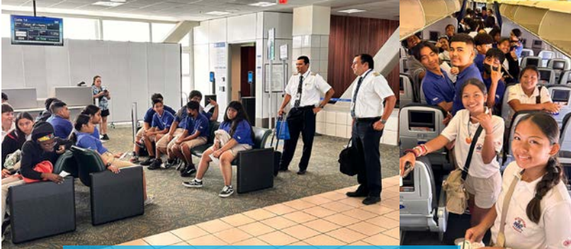
OCEANVIEW MIDDLE SCHOOL Tour 03.12