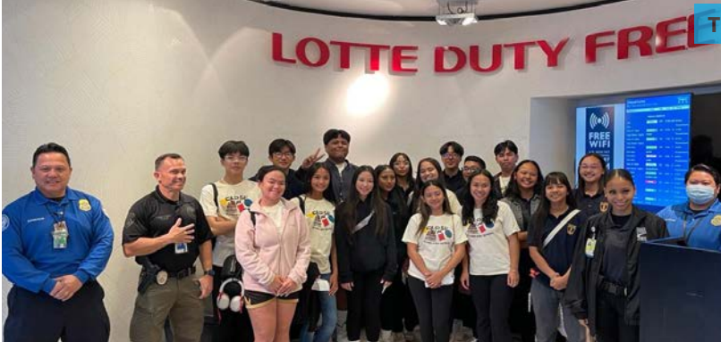
TIYAN HIGH SCHOOL Tour 03.26

The A.B. Won Pat Int'l. Airport Authority, Guam is proud of its robust Airport tour program that is part of their community outreach. Although younger elementary students get a kick out of the K9 demo and getting on a plane, the benefits to older students are more career-focused. From their initial "checking-in" process where they are issued boarding passes by tour partner United Airlines (UA), they are introduced to the passenger service work of airlines. When they clear through security screening, they experience what passengers go through but they also see federal regulatory career opportunities in the aviation industry. As they make their way to the aircraft, they go through the airport's concessions area they are exposed to the many business opportunities in an Airport that help generate revenue for airports and the various services for travelers from food & beverage offerings, to currency exchange, and various levels of retail experiences. Throughout the tour, students are escorted by Airport Police so they also get to see the role of law enforcement in an airport setting, and the K9 explosives detection demo is always a highlight to all levels of learners. The chance to get on jet plane is a great experience with the added valuable presentations by UA flight crew – pilots and flight attendants, and even mechanics.