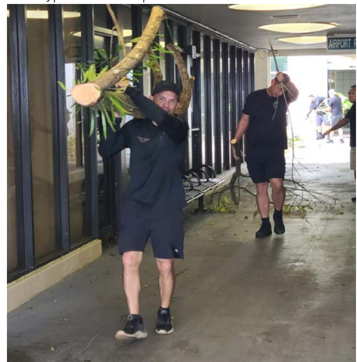
terminal, manning the Emergency Coordination Center 24/7, and fulfilling daily operational duties, despite many of them without electricity and running water.