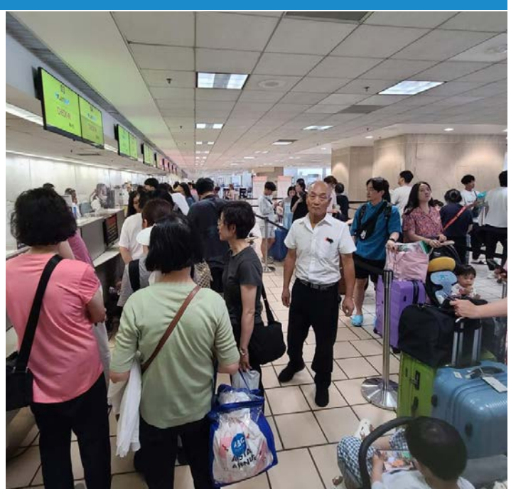
Passengers check in for their departing flights on May 29, 2023. GIAA, airline partners, tenants, and stakeholders, were successful in cleaning up and re-opening the terminal for incoming and departing flights merely five days after Typhoon Mawar passed.