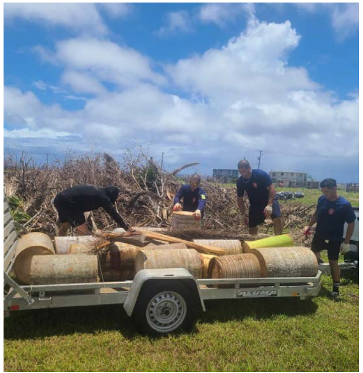
GIAA employees worked tirelessly and dutifully to clean the airport terminal and its facilities of post-Typhoon Mawar debris, damage, and flooding. They devoted countless hours to assisting with the re-opening of the