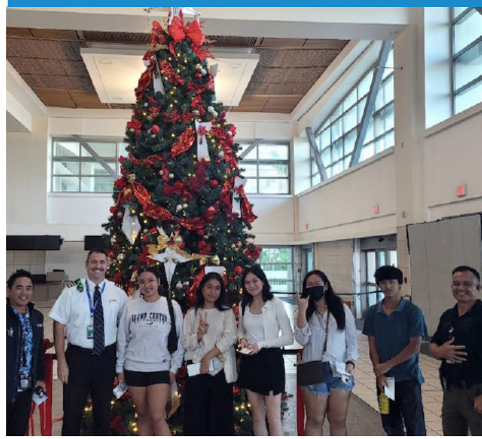
Students from the Guam Community College went on a tour of the Guam Airport, where they were greeted by Airport Police and United Airlines representatives. As part of their Air Transportation Industry course, the students