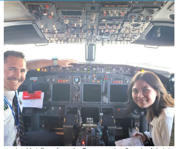
received briefings from the Transportation Security Administration, GIAA Operations, U.S. Customs & Border Protection and Guam Customs & Quarantine and were given a tour of the tower and a United Airlines aircraft.