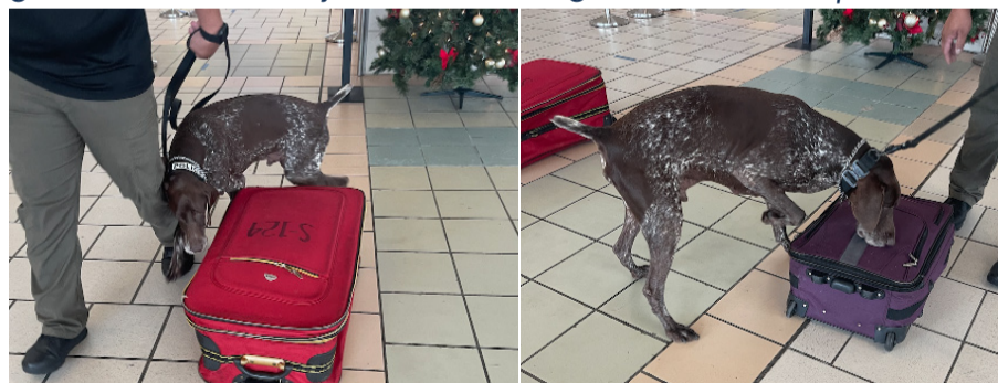
K-9 "Rex", and his handler conduct inspections on baggage in the Ticketing/Check In lobby. Rex is fully certified and trained in explosive detection in the transportation domain, and a deterrent to terrorism.