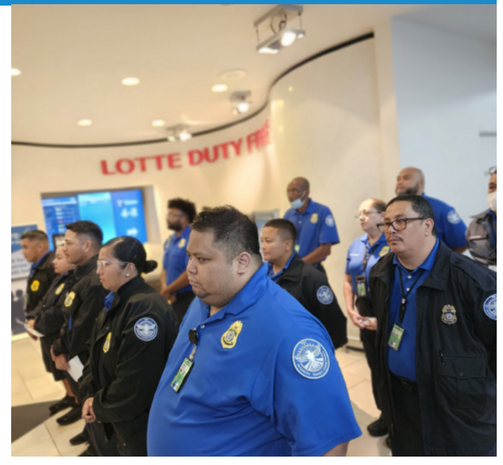
TSA officers, seen above, stand at attention at the Passenger Screening Checkpoint in a moment of silence as they remember and honor the lives lost and affected by the tragic events of 9/11.