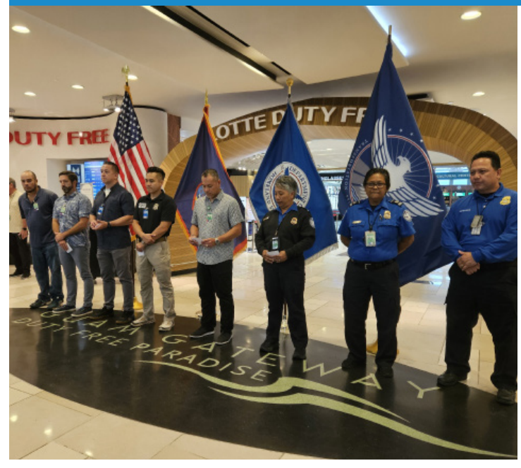
TSA REMEMBERS. On the 23rd anniversary of 9/11, leadership and officers of the Transportation Security Administration (TSA) held a moment of silence on September 11, 2024.