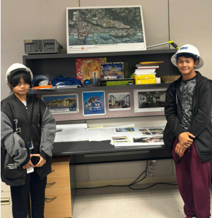
Two interns from the Engineering Division don hardhats and pose in front of renderings and aerial maps in the Engineering Office, before heading to tour airport terminal projects.