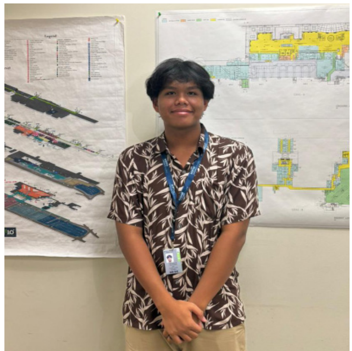
The sole intern assigned to the Property Management Office poses in front of a wall of terminal maps and renderings.