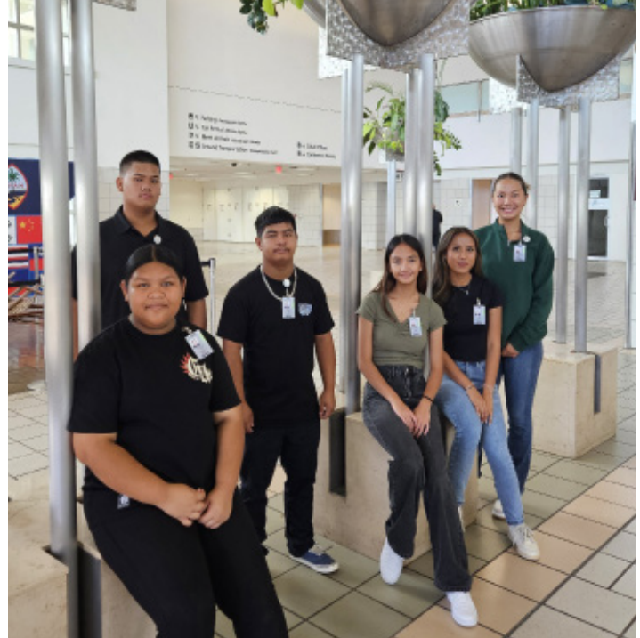
Summer interns from the Operations Division take a break from their office assignments to gather for a photo in the East Ticket Lobby of the main terminal.