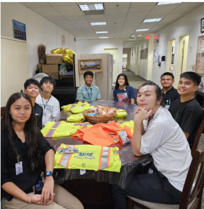
Summer interns from the Properties & Facilities Division gather together for a group photo as they prepare safety vests to wear on their work assignments.