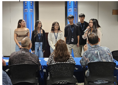
2nd Place - Administration