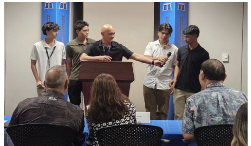
3rd Place - ARFF