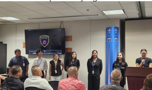
1st Place - Airport Police