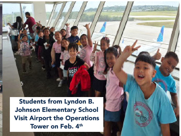
Students from Lyndon B. Johnson Elementary School Visit Airport the Operations Tower on Feb. 4 th