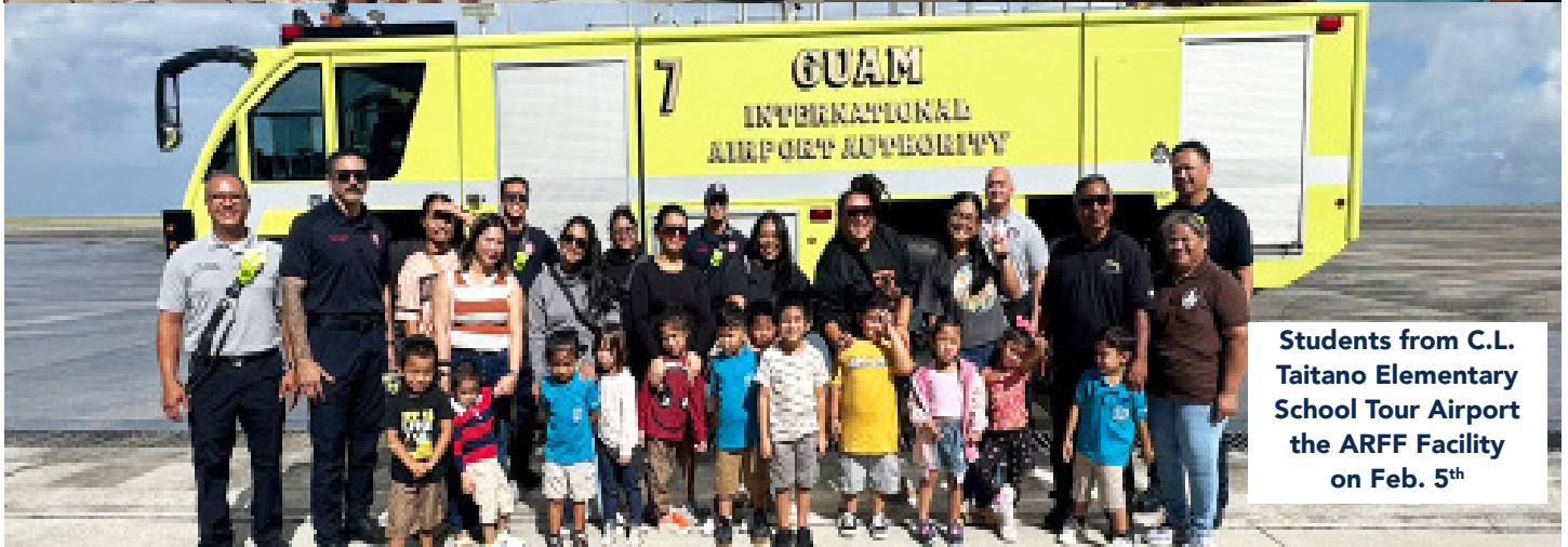
Students from C.L. Taitano Elementary School Tour Airport the ARFF Facility on Feb. 5 th

#guamairport is a monthly GIAA publication! We welcome your article suggestions! Email feature story ideas and photos to marketing@guamairport.net .