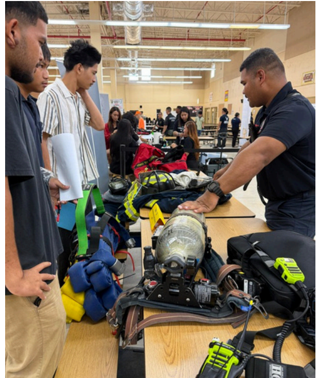
as tools and machines specific to fighting aircraft fires and saving lives in an aircraft accident or incident.