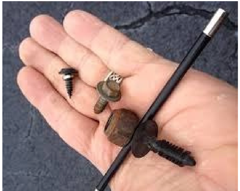
CLEARING FOD FOR SAFER RUNWAYS. Pictured above are examples of debris collected during the Guam Airport's monthly FOD Walks.

Committed to maintaining a safe environment for our passengers and for those who work on and around our airport runways, Jin Air hosted the May FOD Walk on May 19, 2026. Employees from Jin Air, GIAA, and airport tenants volunteered to collect FOD, or Foreign Object Debris, which consist of trash, loose objects or substances on runways, taxiways, or ramps that do not belong in such locations and pose a risk of damaging aircraft or injuring personnel. After a safety briefing, the volunteers - donned with safety vests, closed toe/heel footwear, and gloves - manually scanned the tarmac in search of loose screws, nuts, bolts, mechanics' tools, fragments of broken pavement, pieces of luggage, plastic and other debris that can get sucked into jet engines or damage aircraft tires during takeoff and landing.