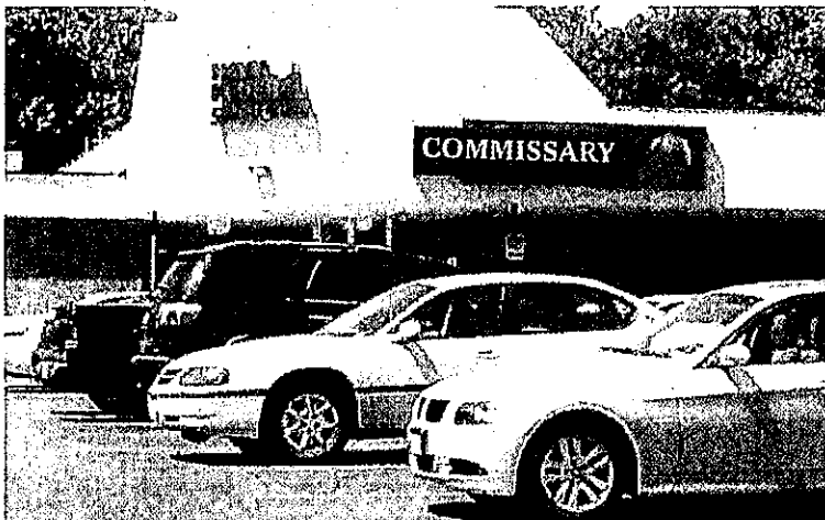
Mandatory federal budget constraints known as sequestration will affect most of the 247 commissaries across the nation.

The closures will be up to 11 days. The Monday closures will be in addition to any day stores are routinely closed. The 148