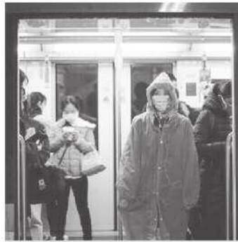
SHANGHAI: A woman wearing a face mask is seen on a subway in Shanghai, China, on March 2.

"Outbreaks in Hubei outside of Wuhan are curbed and provinces outside of Hubei are showing a