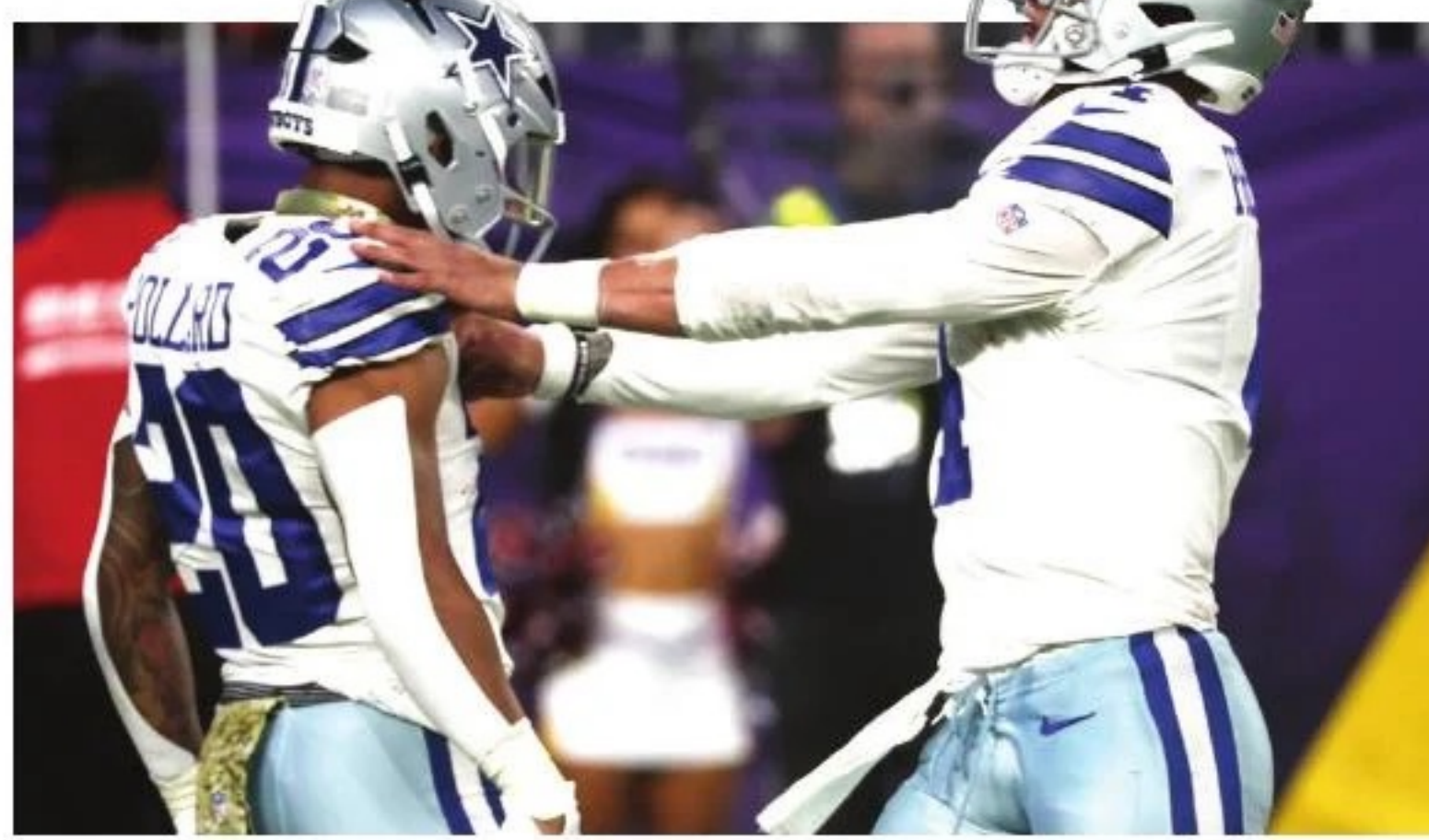
Dallas Cowboys running back Tony Pollard celebrates with teammate quarterback Dak Prescott after catching a 30-yard touchdown pass during the first half against the Minnesota Vikings Nov. 20, 2022, in Minneapolis.

Micah Parsons and Dorance Armstrong had two sacks apiece in the fifth-largest loss